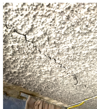
Interior photo of the house