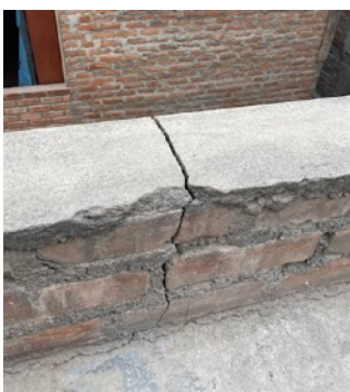
Exterior photo of the house