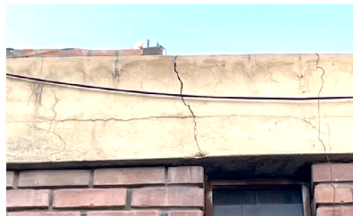
Exterior photo of the house

We have been living in this house at a very low cost for a few years, but now it is suffering damage that needs to be repaired very soon. Due to the age and lack of roofing, most of the roof is cracked inside and out.