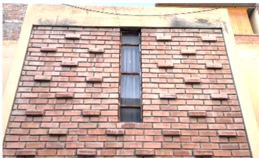
Exterior photo of the house

We started "Reading Club" every Wednesday night. We invite our neighbors to participate.