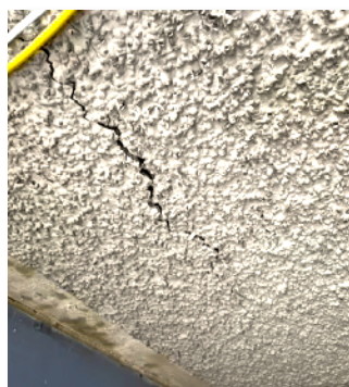
Interior photo of the house